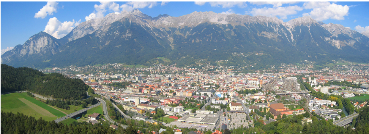
City of Innsbruck

https://orawww.uibk.ac.at/public_prod/owa/ifuonline_lv.home (need to change language from DE->EN)