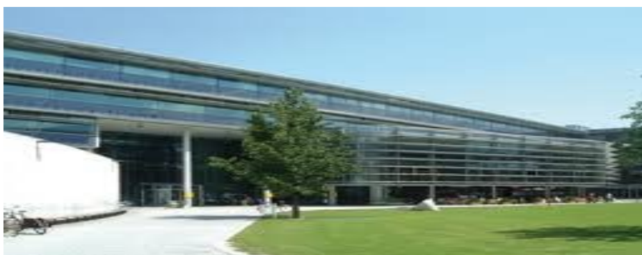
Innsbruck School of Management