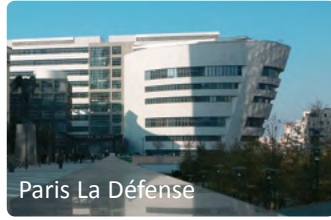
Paris La Défense