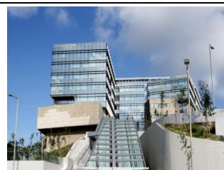
Photo: Lee Shau Kee Business Building